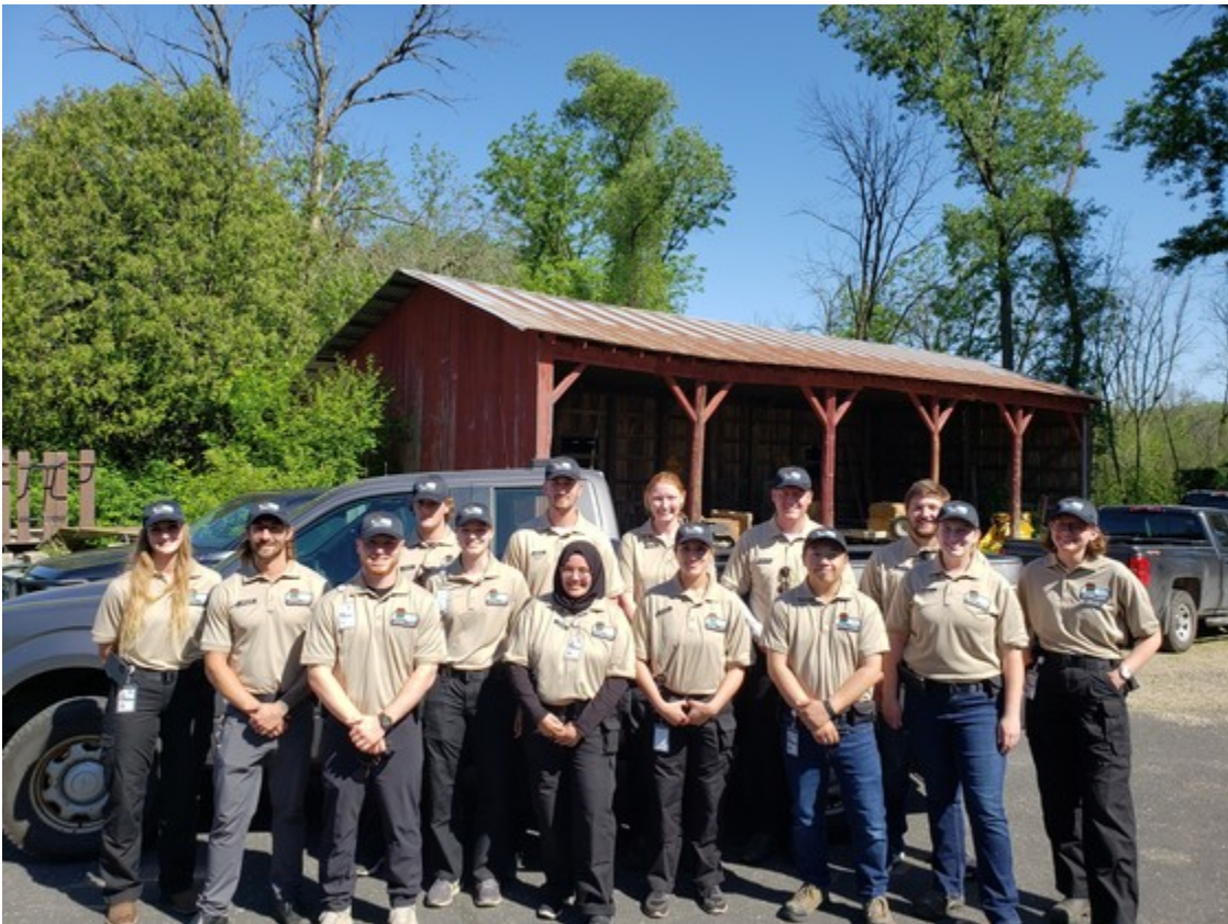
Community Service Officers training for their summer assignments.