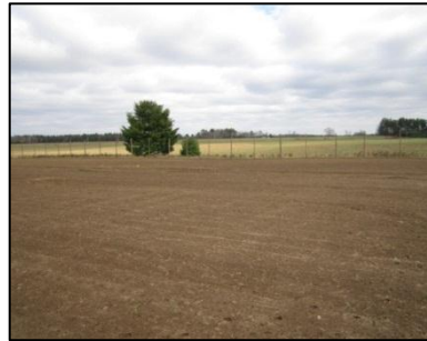
Prepared seed bed

A growing trend in reforestation is direct seeding; scattering seeds on a site rather than planting bare-root seedlings or plugs. Unfortunately, the nursery staff has only anecdotal evidence as to the effectiveness of this type of reforestation. To provide more accurate information to landowners interested in direct seeding, the nursery staff has begun following some of these efforts to monitor their effectiveness.