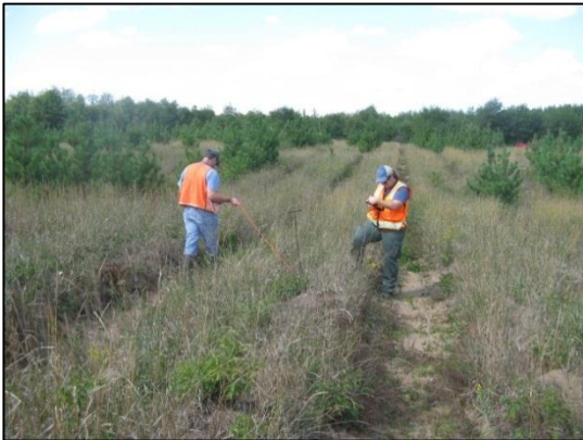
Nursery staff conducting reforestation monitoring survey work.

2012 represented the sixth year of data collection for the reforestation monitoring program. Once a data analysis program is in place, a formal report with management recommendations will be written. In the meantime, to give you an overview of the protocol currently used, read on.