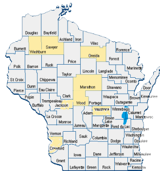
Wisconsin Counties highlighted which host one or more tree improvement plantings

19 seed orchards and progeny tests planted on 132 total acres.