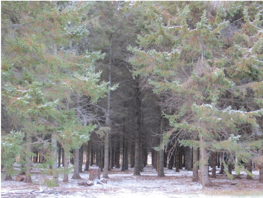
White spruce seed orchard at Mead Wildlife Area November 2018

Wisconsin Department of Natural Resources Division of Forestry and University of Wisconsin-Madison Department of Forest and Wildlife Ecology