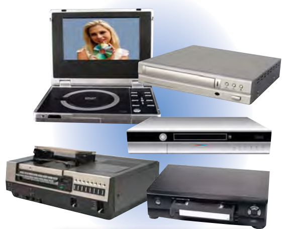
Cov twj saib DVD, cov VCR, DVR thiab lwm cov twj uas saib tau yeeb yaj kiab

Hu rau koj qhov kev pab cuam muab khoom qub coj mus ua dua tshiab hauv zos seb yuav muab cov khoom siv hluav taws xob uas tsis txais rau hauv E-Cycle Wisconsin coj mus ua dua tshiab li cas.