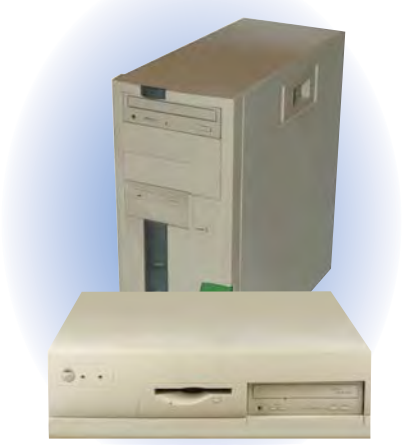
Cov computer loj txawb ntauw rooj

Yog xav nrhiav ib daim ntauw uas muaj E-Cycle Wisconsin cov chaw khaws khoom, mus xyuas ntauw dnr.wi.gov "ecycle."