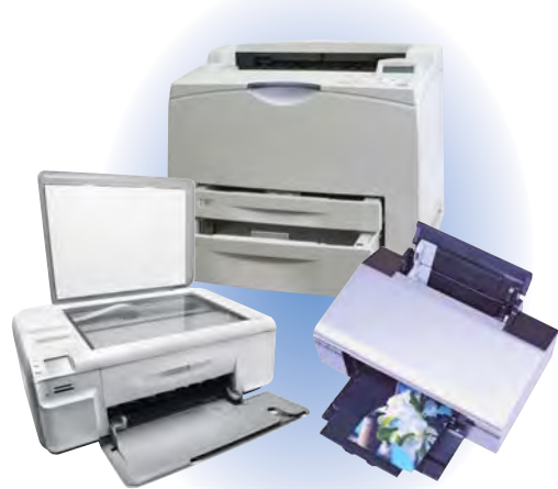
Cov tshuab luam ntauw txawb ntauw rooj, nrog rau cov tshuab luam ntauw uas muaj qhov xa ntauw tau hauv xov tooj, qhov theej thiab qhov luam