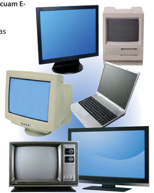
Cov twj uas tso yeeb yaj kiab uas yam ntev yog 7" ntauw qhov ntev tab toj ntauw ib ceg kaum mus rau ib ceg kaum. Cov no suav TV, cov laptop thiab cov computer monitors thiab.