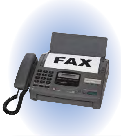
Cov tshuab xa ntauw hauv xov tooj