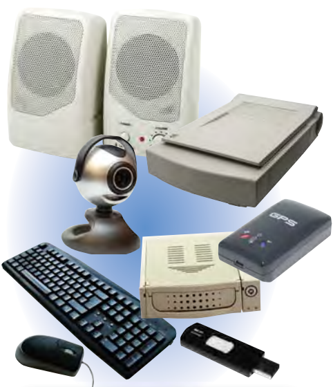
Cov khoom siv rau lub computer xws li daim ntaus (keyboards), cov twj siv tes txav ib qho rau ib qho (mice), cov hard drives, cov twj theej, cov paj taub, cov flash drives, cov modems sab nraud thiab lwm cov twj