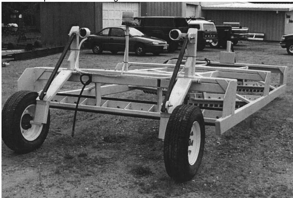
Example of Class 1 Drag